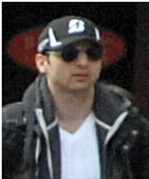
Tsarnaev at the site of the bombings

In the early hours of April 19, 2013, in Watertown , a suburb of Boston, Tsarnaev engaged in a shootout alongside his brother against local police authority. During the conflict, he sustained wounds to his back and legs, both being non-fatal. Eventually, he ran into the road and engaged in a physical fight with two officers with all three of them being thrown to the floor. Dzhokhar then