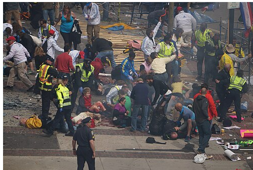
Boston Marathon bombing